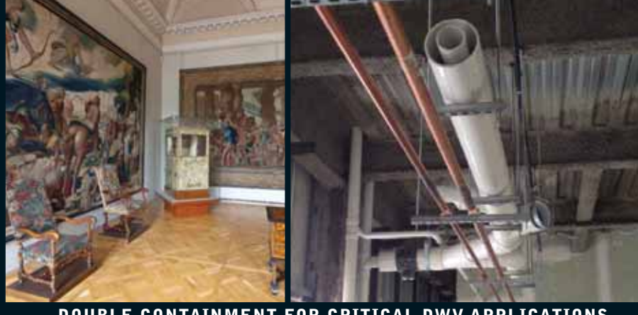
DOUBLE CONTAINMENT FOR CRITICAL DWV APPLICATIONS

A COMPLETE DOUBLE CONTAINMENT DRAINAGE SYSTEM – Enabling Improved Safety and Reliability in Drainage Applications