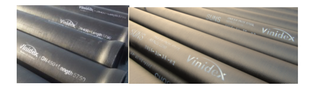
FIGURE 2 EXAMPLES OF MARKING

· Colour coding of pipe classes: See Appendix A